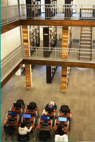
The three levels of the renovated building

Everyone understood the importance of a library to a town