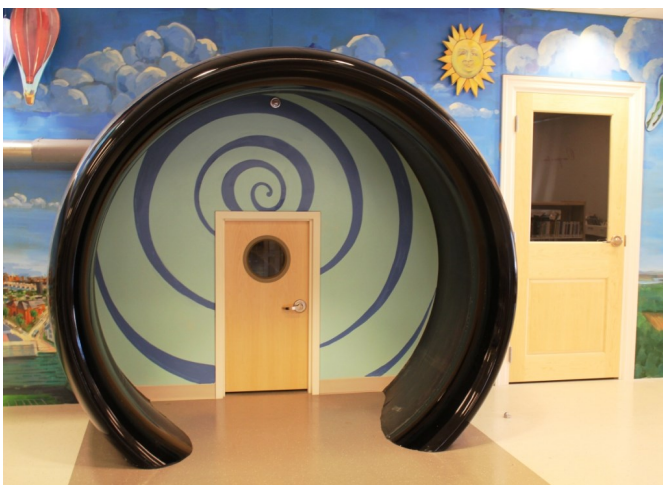
Children can walk into the programming room through a pint-sized door built like an airplane engine

Hansen herself didn't get through the renovation without injury, developing problems with both feet that has put her on crutches until they heal. But she is smiling through it all. ♦