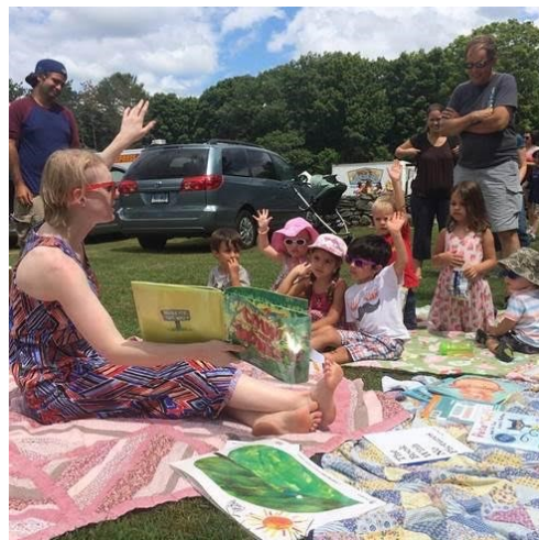
Booth &amp; Dimock's outdoor storytime

The East Granby Public Library has been involved with our town farmers' market since it started 5 years ago. I was part of the startup and planning committee. The library is the umbrella 501C3 of the market. All the proceeds after expenses benefit the library. The 2 nd year I became the Market Manager. I believe 2015 was our 5 th year. I moved the market from the center shopping center to the library parking lot. We tied the market into our summer reading theme, "Read Seeds & a Little Farm Magic." We had a town wide read featuring the book "The Dirty Life" and Skype with the author. The children received a different veggie every week to decorate and plant in the hallway. Our movie every week was about food. We have lost a few vendors, but I still feel that the market is a great community event. ◆