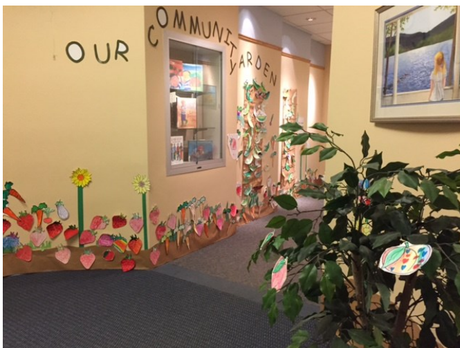
East Granby Public Library's decorated hallway garden

The East Granby Public Library has been involved with our town farmers' market since it started 5 years ago. I was part of the startup and planning committee. The library is the umbrella 501C3 of the market. All the proceeds after expenses benefit the library. The 2 nd year I became the Market Manager. I believe 2015 was our 5 th year. I moved the market from the center shopping center to the library parking lot. We tied the market into our summer reading theme, "Read Seeds & a Little Farm Magic." We had a town wide read featuring the book "The Dirty Life" and Skype with the author. The children received a different veggie every week to decorate and plant in the hallway. Our movie every week was about food. We have lost a few vendors, but I still feel that the market is a great community event. ◆