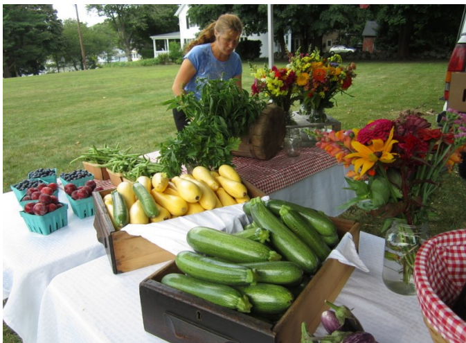
Bill Memorial Library in the City of Groton

The Bill Memorial Library has hosted a small farmers' market on Tuesdays during the summer for the past 3 years and it has been very successful for us. We only have one farm, The Collins Farm from Oakdale, CT, which is a small family farm. They set up every week during our weekly summer reading programs and the parents as well as local neighbors really appreciate the opportunity to get fresh produce. We promote it on our Facebook page and website, and the City of Groton, where the library is located, also promotes it for the residents. It has been a real nice addition to our summer and we are interested in expanding it next year.