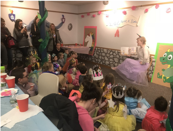
Children at the Booth & Dimock Memorial Library enjoyed a fairy tale ball.