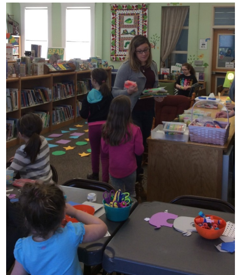
The Giant Jumperee was at Beardsley Library! From elephants to rabbits, giant jumps to small hops, the children (and adults) had a wonderful Take Your Child to the Library Day! ♦