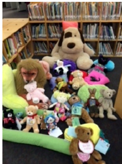
Teddy Bear Sleepover at Thompson Public Library!