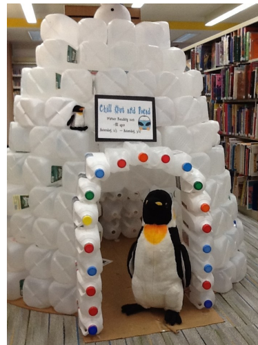
Woodbury Public Library's igloo is designed to be a special reading space available during their Winter Reading Program, Chill Out and Read, which kicked off on Take Your Child to the Library Day.