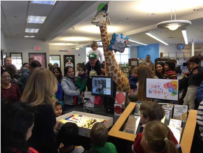
At the Groton Public Library, families celebrated the birthday of Stretch, the library's giraffe mascot.