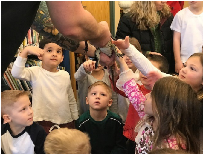
East Granby Public Library was pleased to host Riverside Reptiles to introduce & educate children about ancient reptiles (including an 80 lb swamp monster!) As you can see they were enthralled & delighted!!