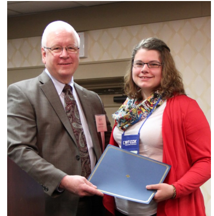
Scenes from Conference